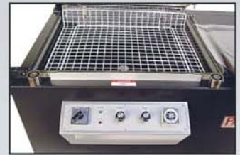
Dual Magnet Hold Down During Seal Cycle.

New Design with Larger Capacity Seal Area 12"W x 18.5"L